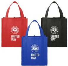
Shopper Tote—$10.00 Pack of 3