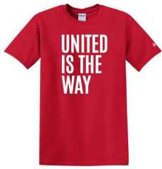
T-Shirt—$7.00 Specify Size