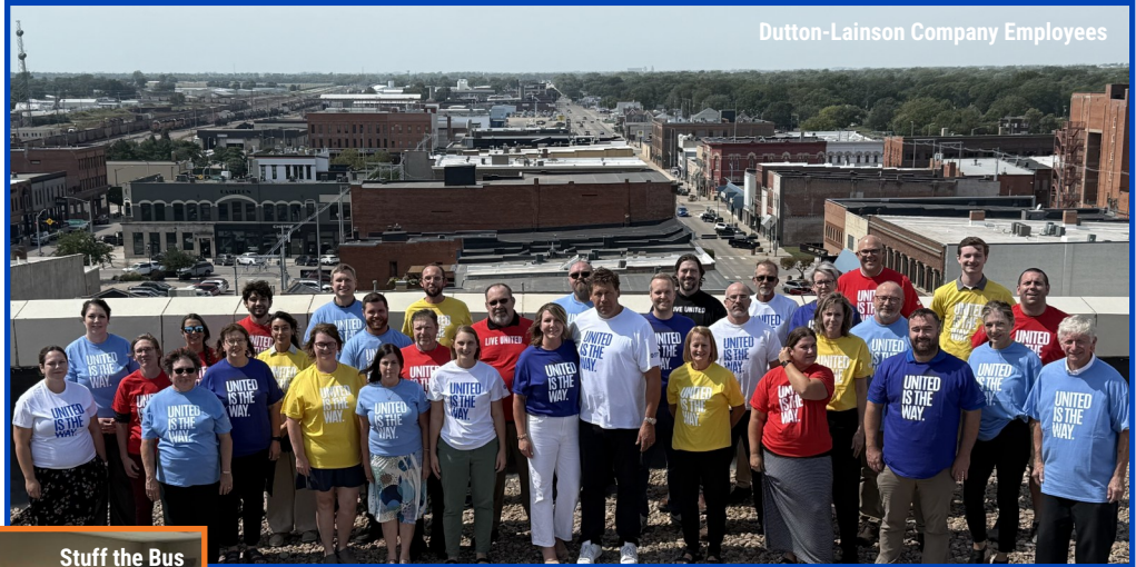
Dutton-Lainson Company Employees