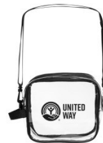
Clear Crossbody Bag— $9.00