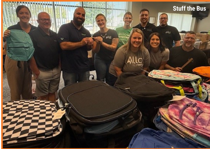
Stuff the Bus

UNITED WAY COORDINATES COMMUNITY-WIDE EFFORTS LIKE STUFF THE BUS, WHERE VOLUNTEERS LIKE THOSE PICTURED, COMBINED WITH GENEROUS DONORS, TO STUFF 361 BACKPACKS WITH SCHOOL SUPPLIES—ENSURING LOCAL STUDENTS STARTED THE YEAR READY TO LEARN.