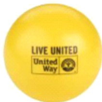
Stress Ball $9.00/ pack 10