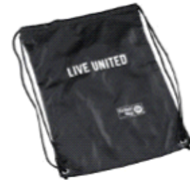
Drawstring Backpack $7.75 / 5 pack