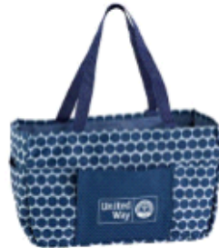
Shopping Tote $5.10