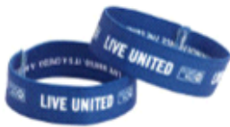
Wristbands $9.70 / 10 pack