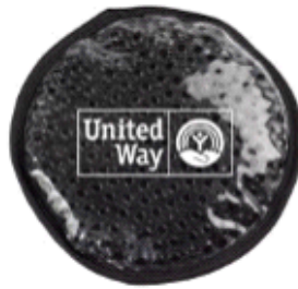
Cold Pack $2.20