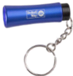
Lighted Keychain $2.55