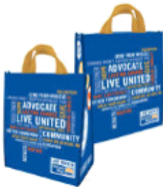
Canvas Tote $5.91 5 pack