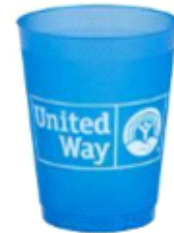
Color change Cup $12.70 / pack 25